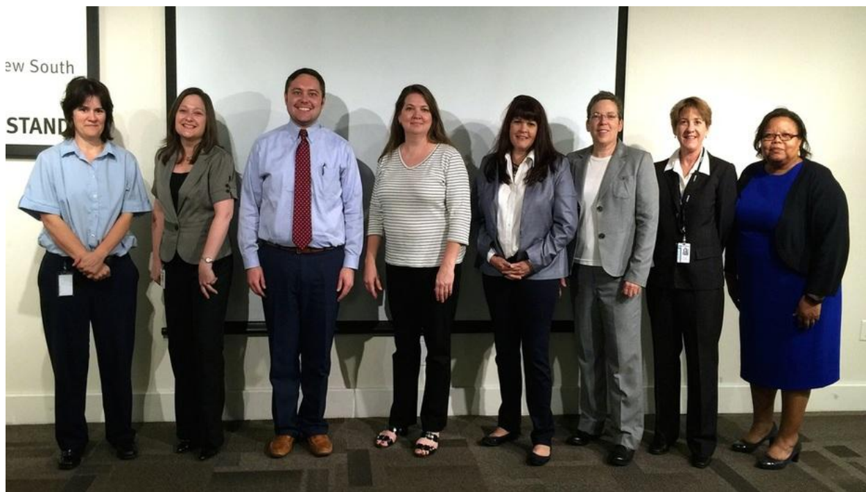
Photo: 2015-2017 Executive Board at Installation Luncheon